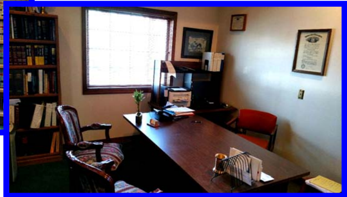
2 ND OFFICE