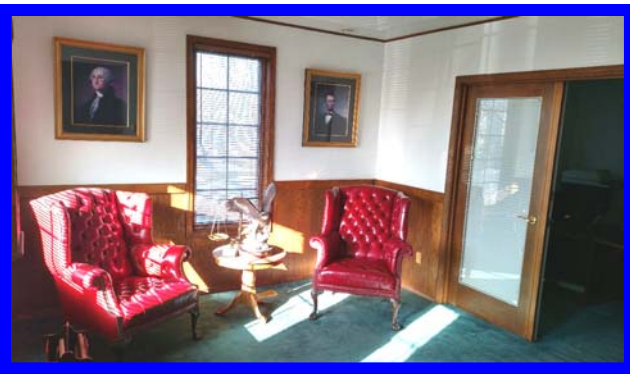
ENTRY / WAITING ROOM